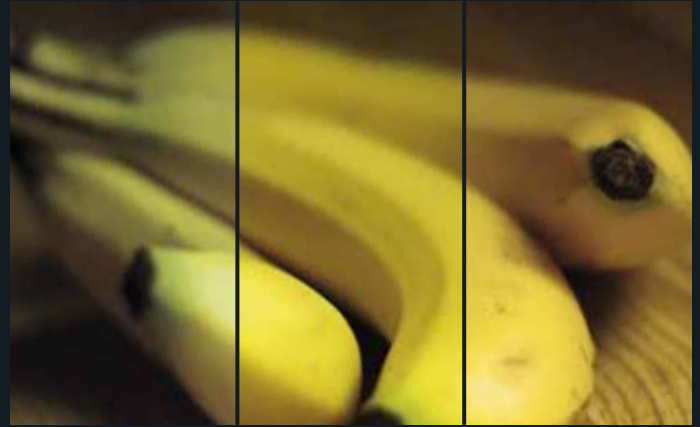
Perfect illumination with variable colour temperature.

Noise level: Particular attention was paid on a noise reduced performance of the JBLED A7. The two fans perform at a very low noise level due to their size and air flow rate. The JBLED A7 can be set to studio mode if further noise reduction is required. Pan and tilt movements are driven by nearly noiseless 3-phase stepping motors. The JBLED A7 is first choice when it comes to noise sensitive applications such as theatres and TV-studios.